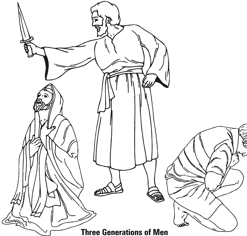
Three Generations of Men

The one who sins is the one who dies. The son shall not be punished for his father's sins, nor the father for his son's. The righteous person will be rewarded for his own goodness and the wicked person for his wickedness. ■